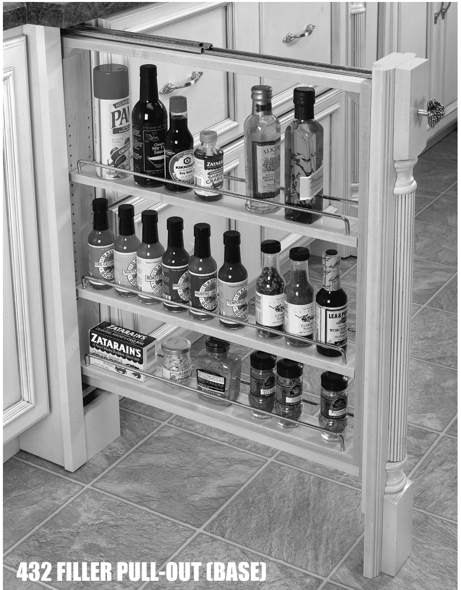
432 FILLER PULL-OUT (BASE)