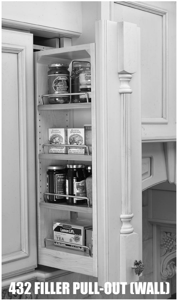
432 FILLER PULL-OUT (WALL)

432 SERIES WALL FILLER PULL-OUTS COME IN THREE HEIGHTS!