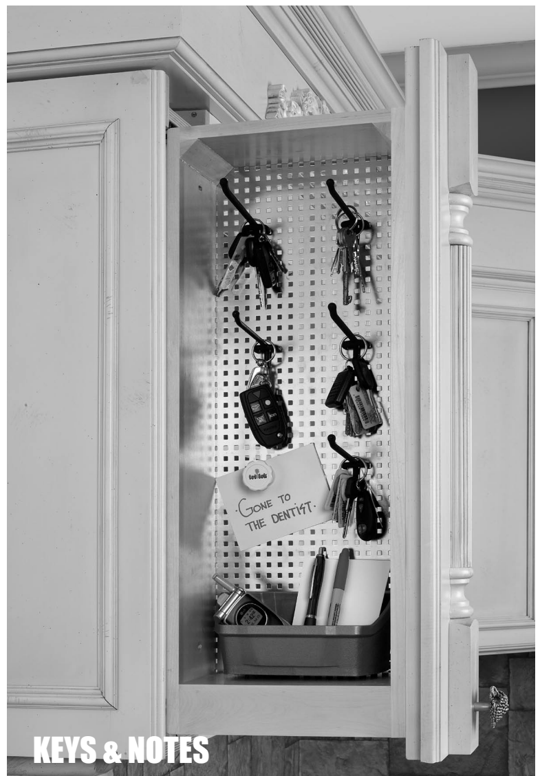
KEYS & NOTES